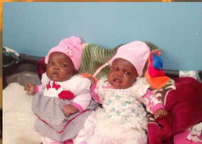
Two Cute Twin Babies