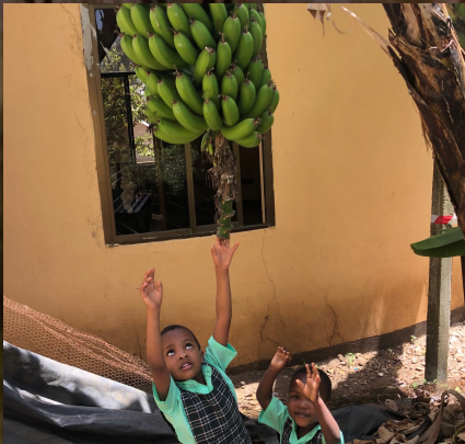
Reaching for Bananas

NOTE: This page doesn't look much like Christmas, but remember, in Africa, Christmas is in the summer.