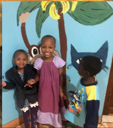
In the Little Kids Rooms