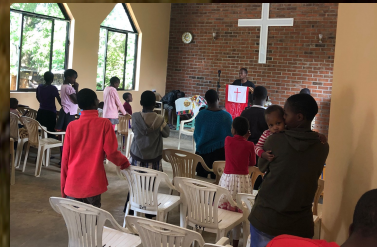
Daily Chapel Service