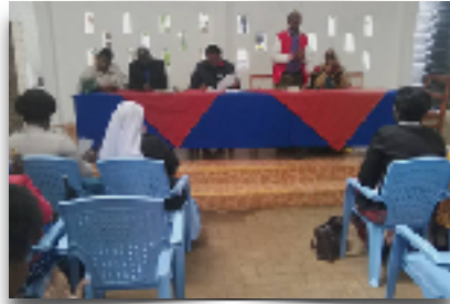
Orphanage Directors Meeting