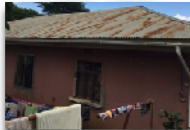
Rusty roof before being repaired