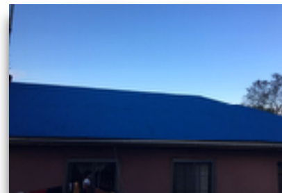
Rusty roof after being repaired