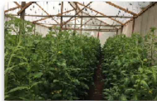
A harvest of tomatoes from the greenhouse!