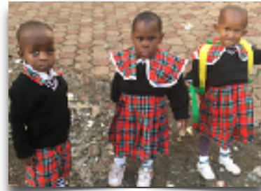
First Day of Toddler School (It is so cute we had to show it again!)