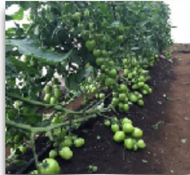
More tomatoes from the greenhouse!