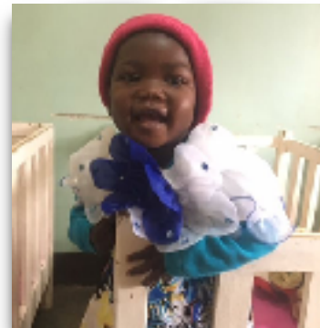
Newest picture of baby Maua "Flower"